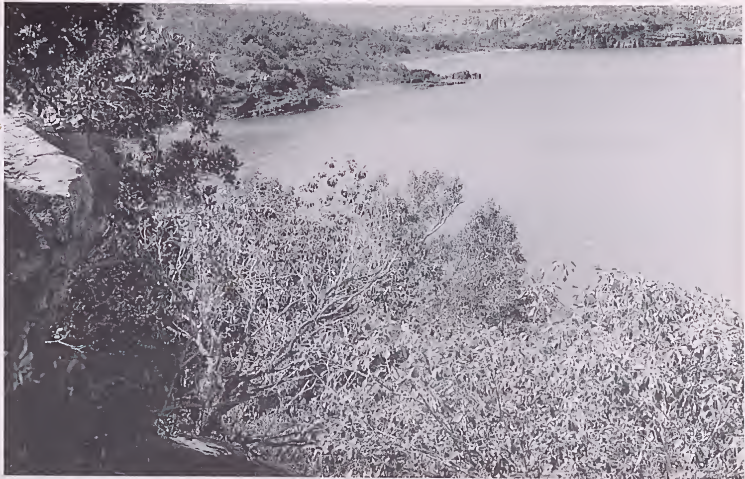
Figure 9. Vine Thicket on sandstone cliffs, West Governor Island.